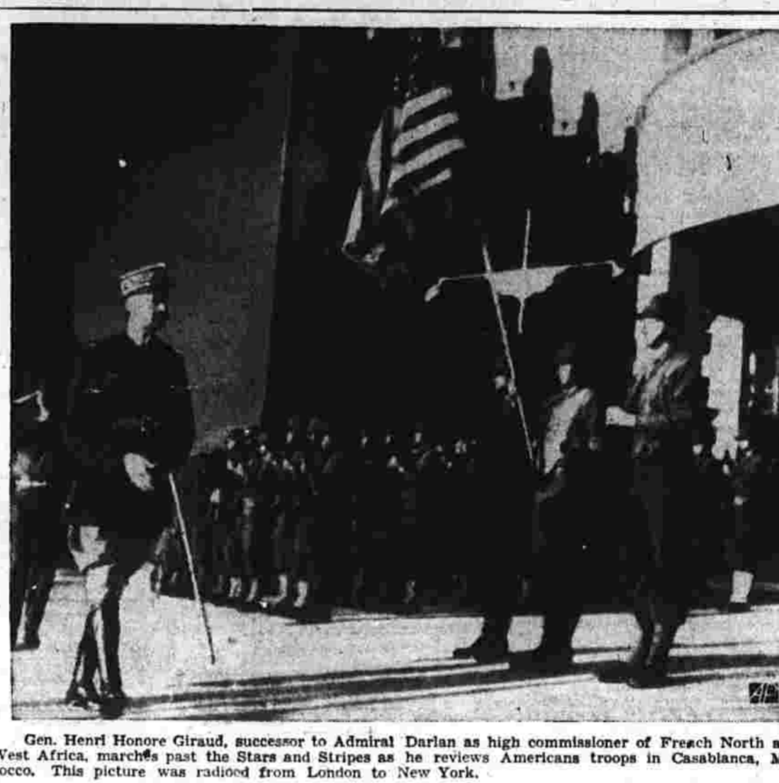
Gen. Henri Honoré Giraud, successor to Admiral Darlan as high commissioner of French North and West Africa, marks past the Stars and Stripes as he reviews Americans troops in Casablanca, Morocco. This picture was radiated from London to New York.